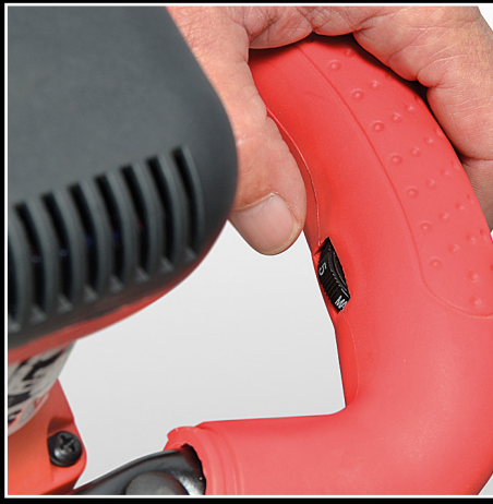
Electronic rotation speed variator up to 6 levels